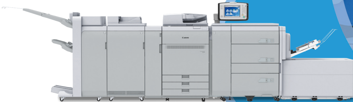
imagePRESS C910 shown with optional accessories.

Incorporated into this color digital press is Canon's passion and unique understanding of imaging, photography, color science, and workflow. This expertise has resulted in a high-quality digital press that's both productive and versatile for printing establishments of varying shapes and sizes.